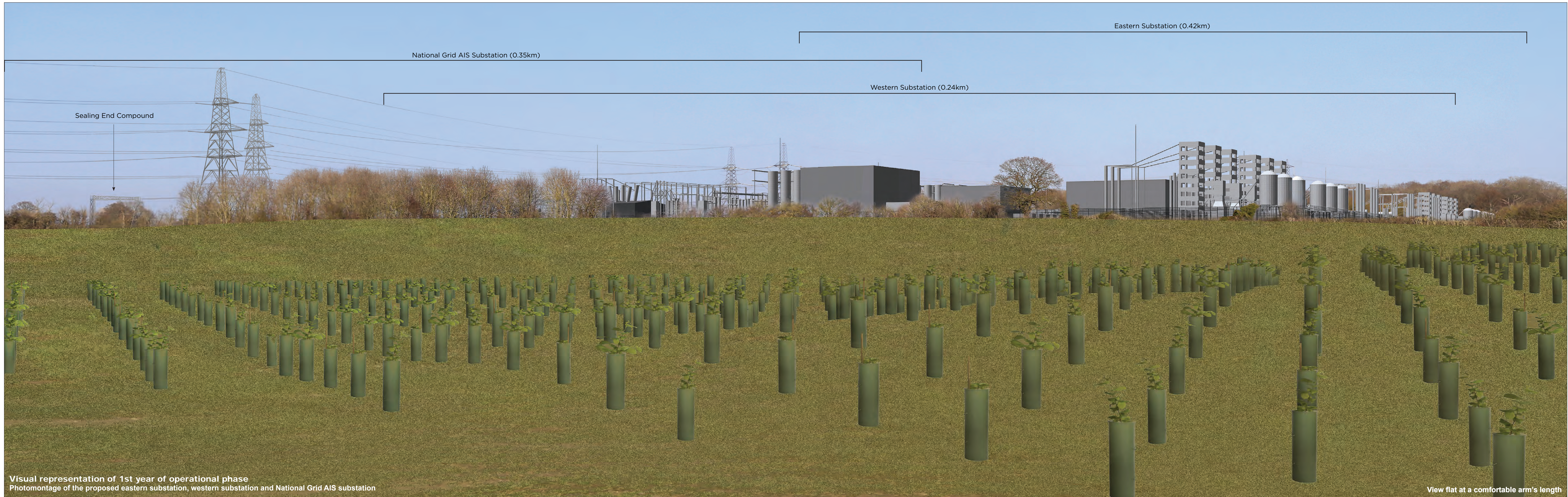
Visual representation of 1st year of operational phase Photomontage of the proposed eastern substation, western substation and National Grid AIS substation