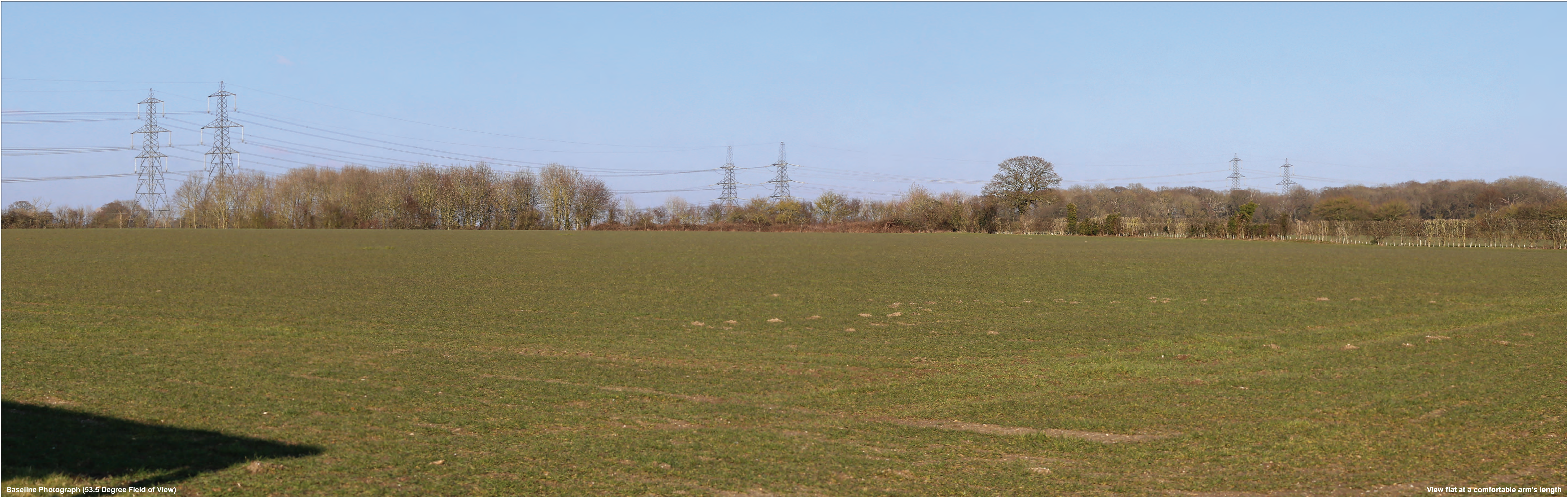
Baseline Photograph (53.5 Degree Field of View)