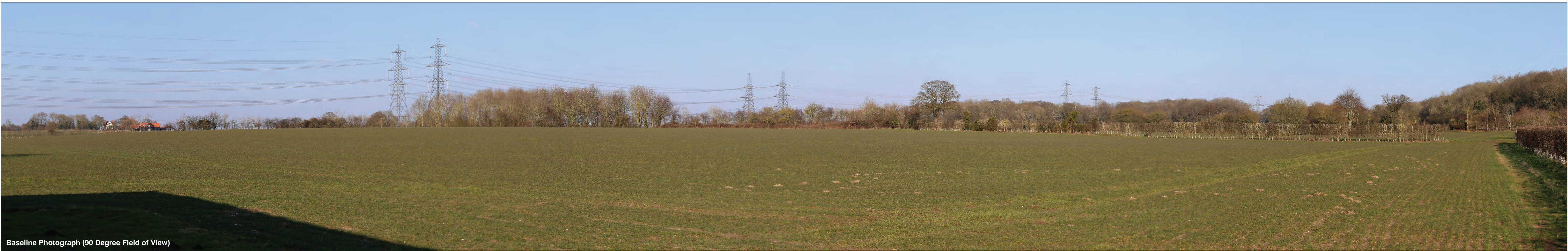
Baseline Photograph (90 Degree Field of View)