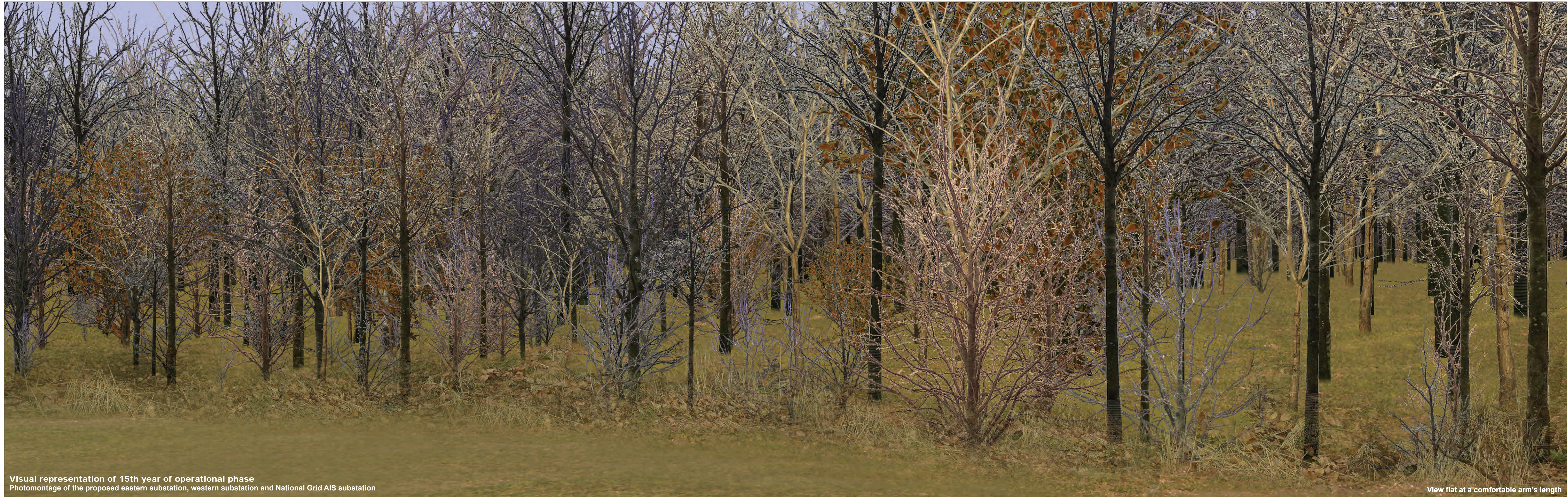
Visual representation of 15th year of operational phase Photomontage of the proposed eastern substation, western substation and National Grid AIS substation