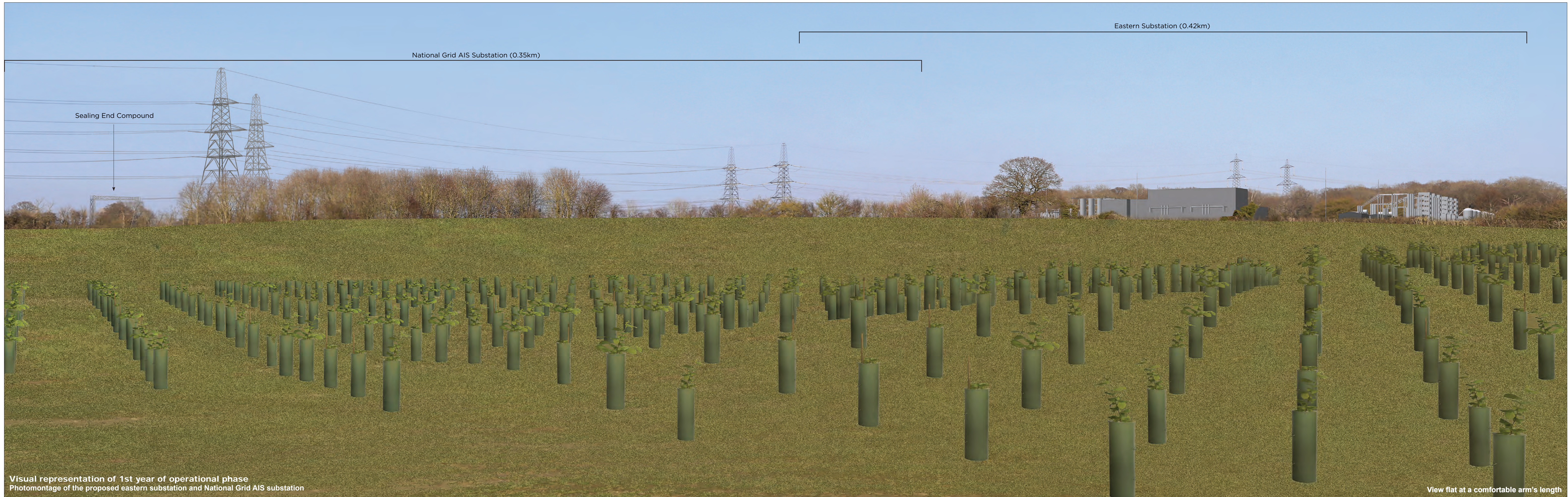
Visual representation of 1st year of operational phase Photomontage of the proposed eastern substation and National Grid AIS substation